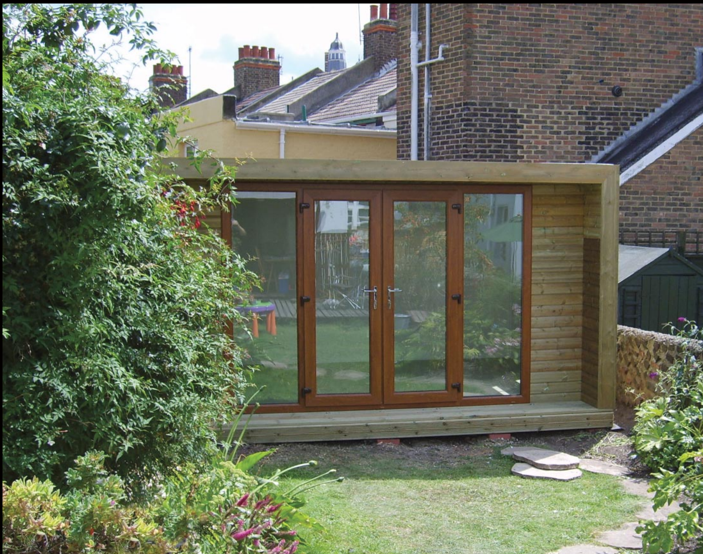
The Kew with French Window Combination Option